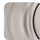
Satin Nickel 15