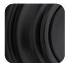
Matte Black 514