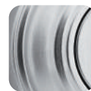
Satin Chrome 26D