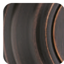
Venetian Broze 11P