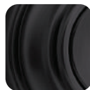
Matte Black 514