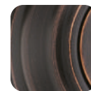
Venetian Broze 11P